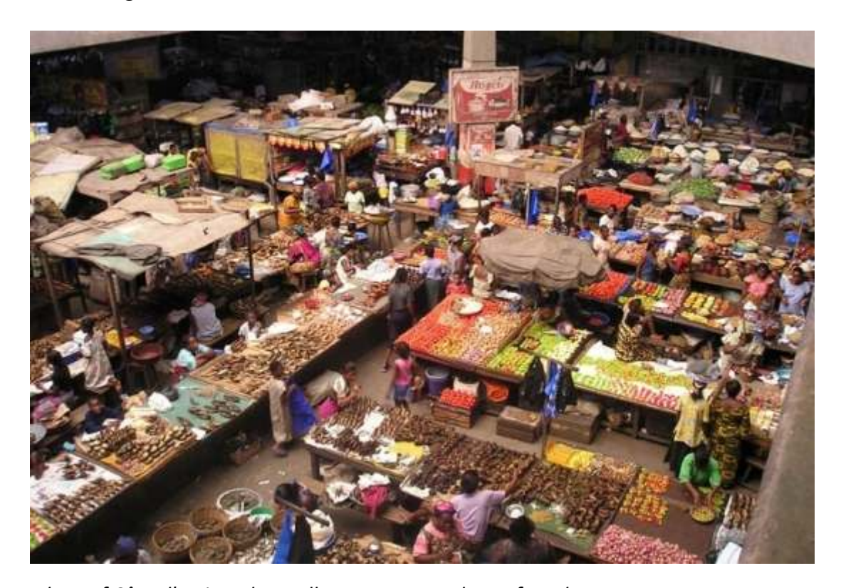
Figure 2 : The markets of Côte d'Ivoire where all consumer goods are found

Food products such as bananas, yams and vegetables delight locals and tourists alike who come looking for Ivorian products to cook and taste. The primary purpose of these markets is also to sell these food products. The different products present on the Ivorian markets are often organized into several sectors which can extend over impressive surfaces. Below, a view of the Yamoussoukro market is one of those huge markets in Côte d'Ivoire.