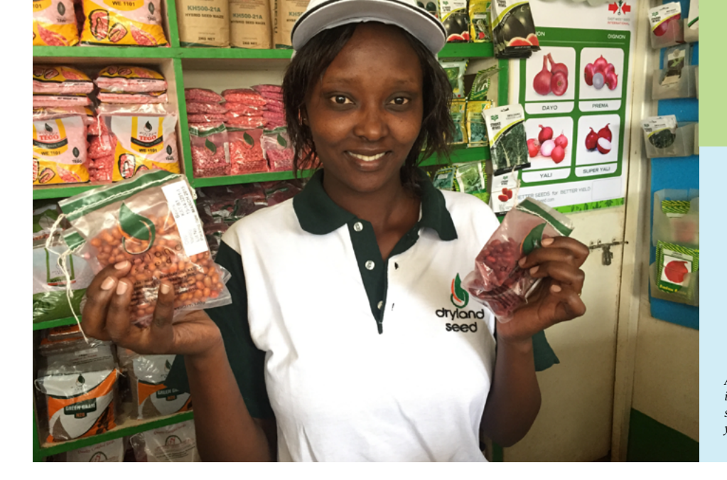
An agricultural inputs vendor in Machakos, Kenya, displays sample packs of seed of highyielding bean varieties.